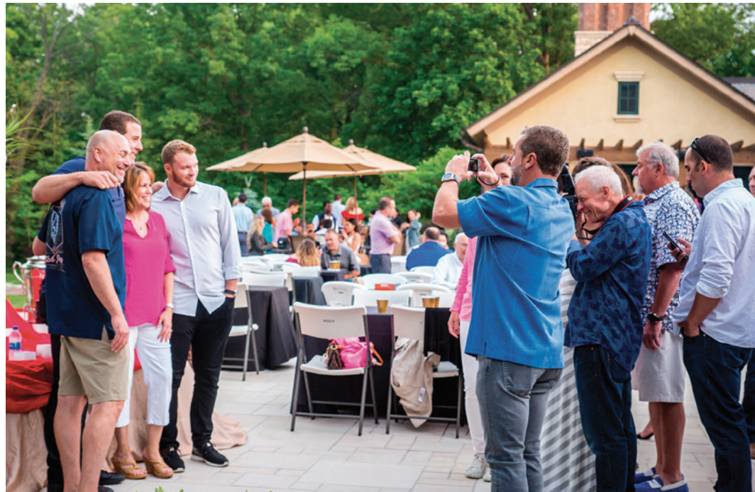
Many prominent Barrington residents joined this year's event for the first time to support the Anthony Rizzo Family Foundation.