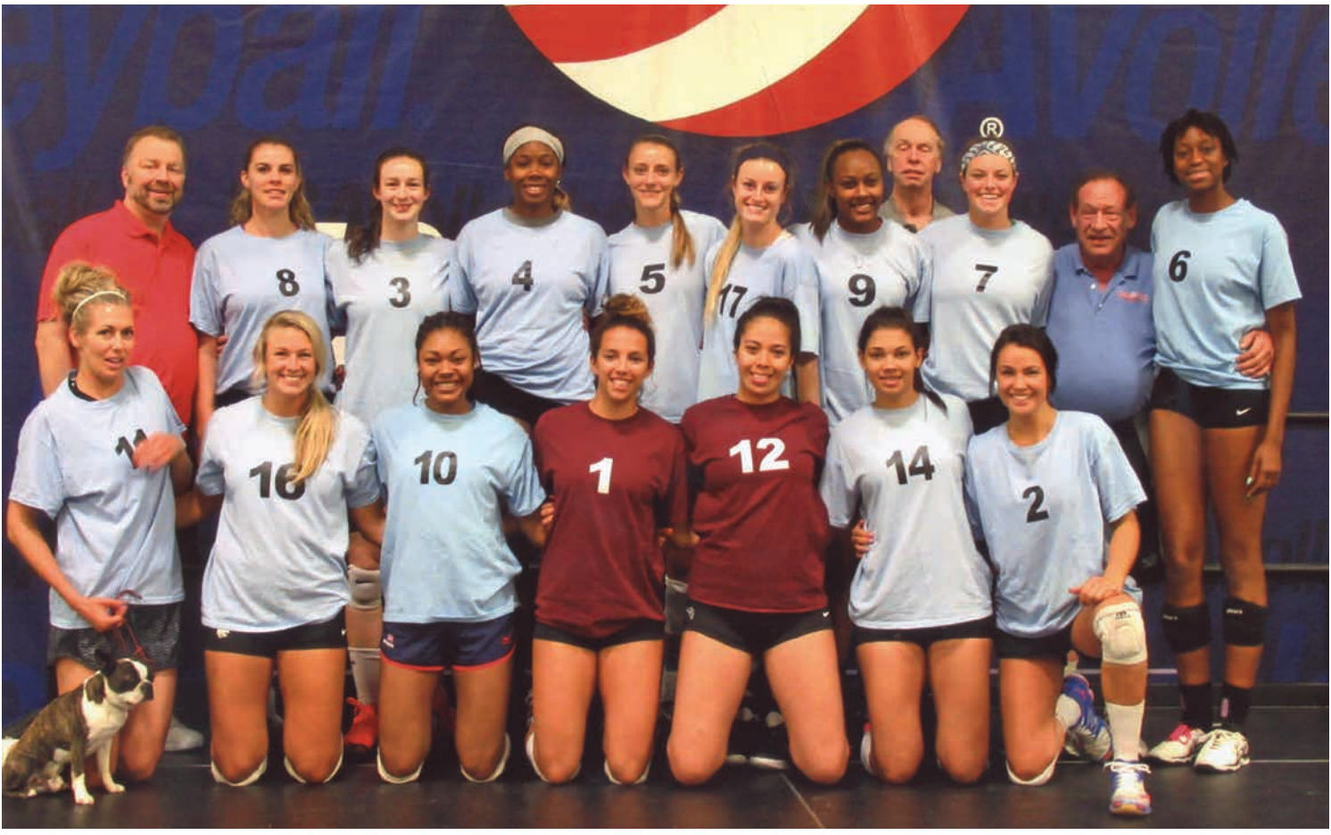
The Exterminators Team is looking for new sponsors for 2018.