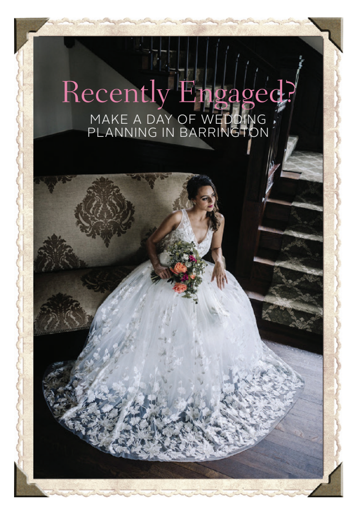
Barrington's White House Bridal Open House and Barrington Bridal Tour is on February 22, 2020.

ARRINGTON IS THE PLACE TO BE for wedding planning in 2020! On February 22 from 10 a.m. to 5 p.m., drop by Barrington's White House to experience a "real wedding," complete with flowers, food, and the latest trends at its Bridal Open House. It's a great way to check out vendors and see this beautiful mansion all dressed up and ready for a party!