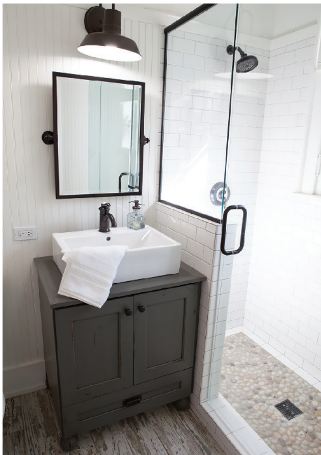
Black accents with soot colored cabinetry.