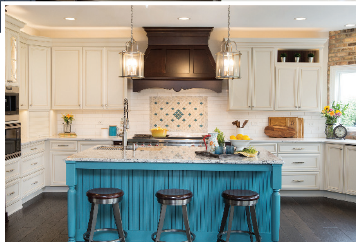
Traditional white/cherry cabinetry with a blue island.

You've already seen it everywhere, but blue is here to stay for a while. As a matter of fact "Classic Blue" was recently announced as the Pantone 2020 Color of the Year. So if you've already been thinking of Blue in your home, go for it. Use it sparingly on walls and accessories, pillows and throws, or commit to the blue kitchen island if you really love it and want to keep it around long after it goes out of style. Blue works well with classic grays, whites, and natural wood tones in any room.