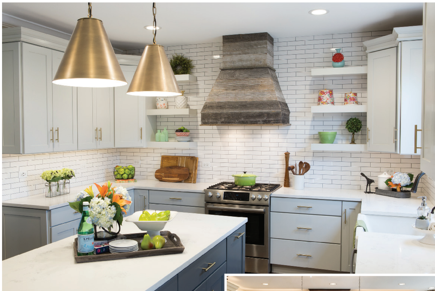
Transitional white kitchen with slate blue island and natural hand-made textured wood hood.