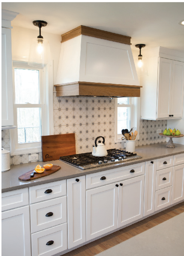
Creamy white kitchen with natural wood tone hood accents/contrasting hardware and fixtures.