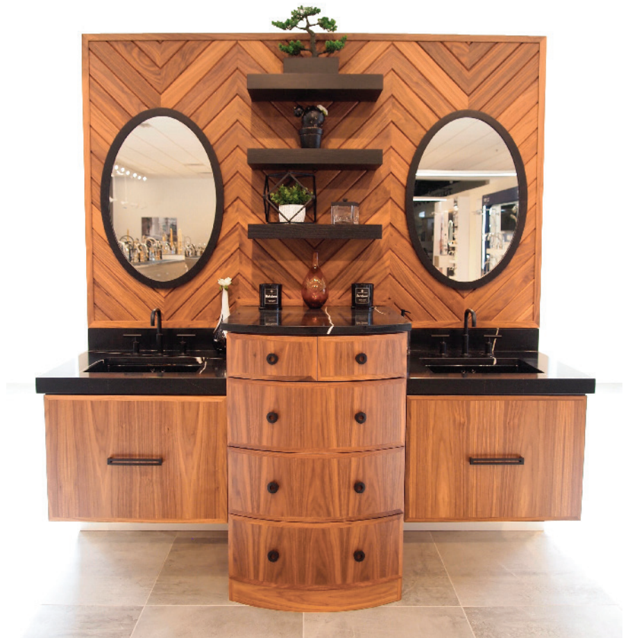
The Wilco Cabinetry display at the new Palatine showroom.