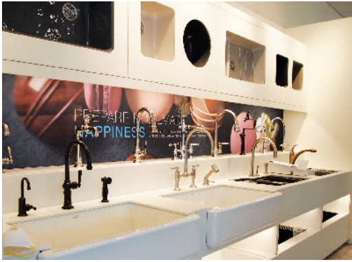
A display of kitchen sinks and faucets in the new Kohler Signature Store.