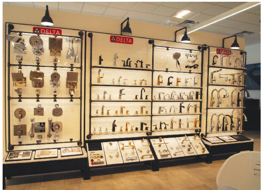
The Delta display at the new Palatine showroom featuring faucets, showerheads and hardware.