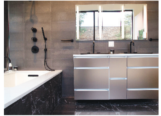
One of the new bathroom suites in the new Kohler Signature Store.