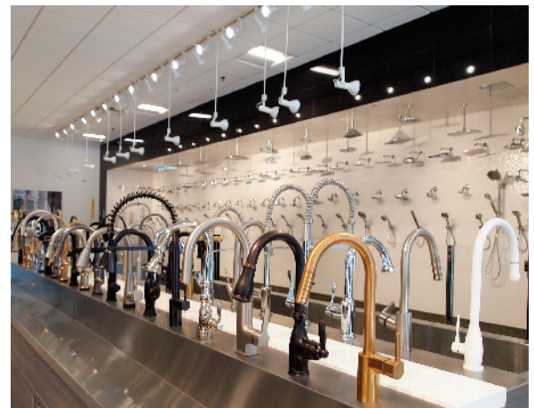
The complete view of all the working plumbing displays at the new Palatine Showroom. The showerheads and faucets pictured are all interactive, and several are motion-activated.