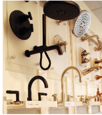
The Newport Brass display at the new Palatine showroom featuring faucets and showerheads.