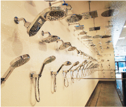
The 60-foot long shower wall at the new Palatine showroom. All of the showerheads are working and interactive, so customers can see the pressure of the showerheads and body sprays side by side.

preferences, a full team of experienced product specialists, designers, customer service representatives, and showroom associates are on hand to help through every step of a home design project.