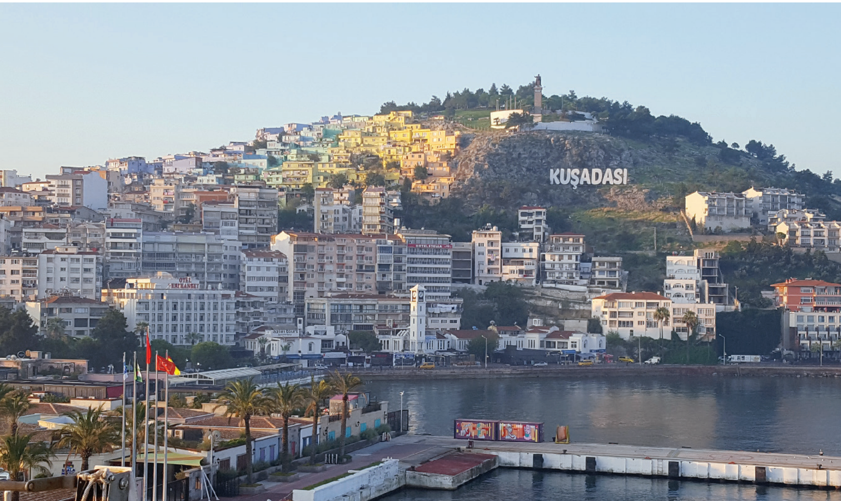
A panoramic view from the Azamara Journey pulling into the Port of Kusadasi.