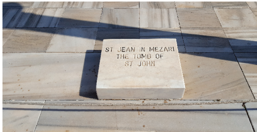
On the surface of the Tomb of St. John in Ephesus, Turkey.