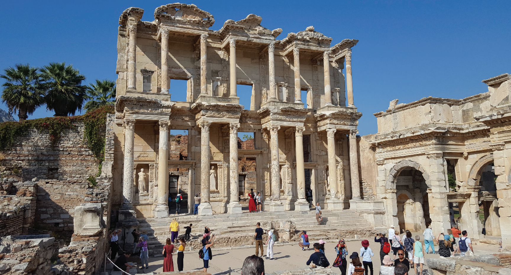
ABOVE: The Library of Celsus is rumored to hold 12,000 scrolls entombed in marble sarcophaguses.