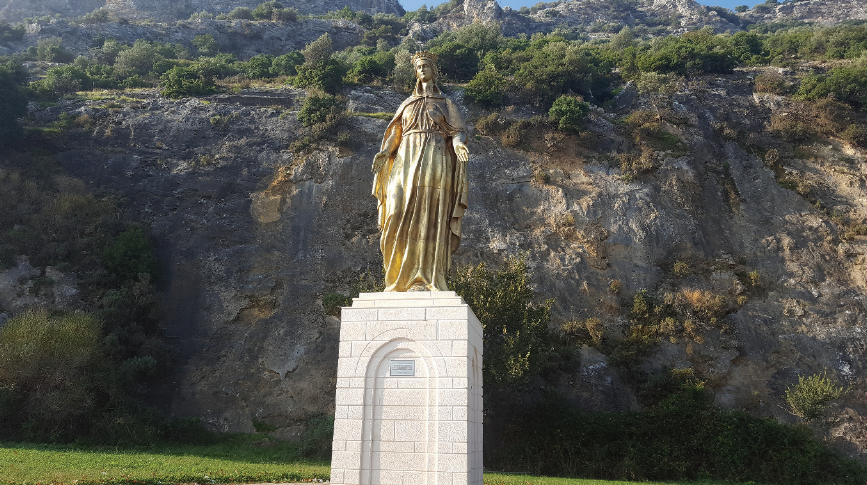
A Golden Tribute to the Virgin Mary at Meryem Ana Evi, the House of the Virgin Mary.