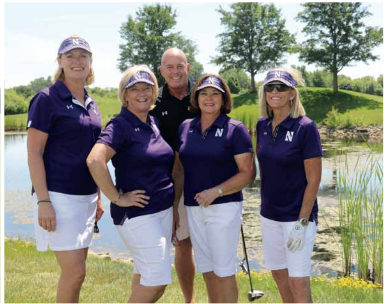
A Solly's Way Foundation golf group.