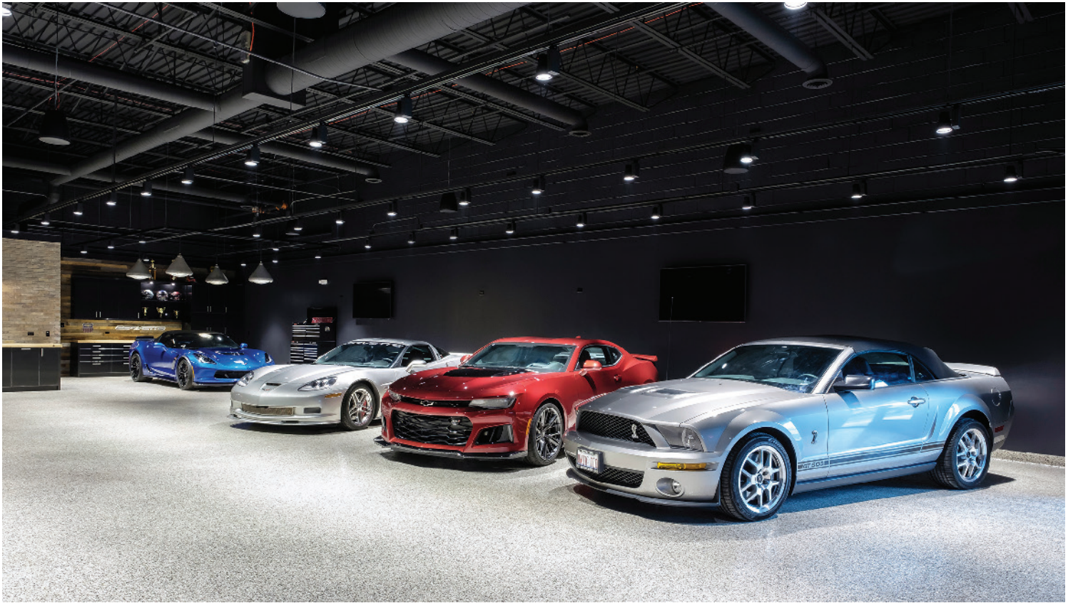
The spotless storage area for Brian's sports cars also offers a mechanic's space where he can work on them.