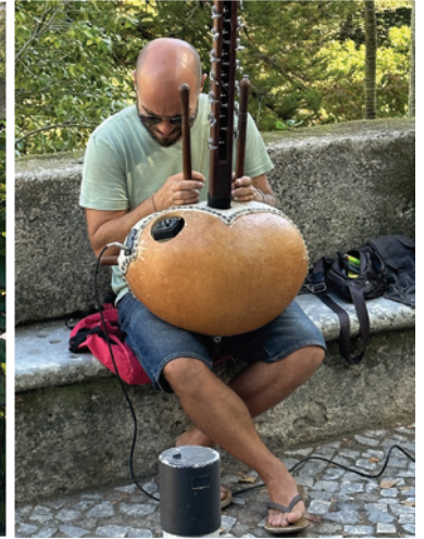
A gourd musician entertains our group.