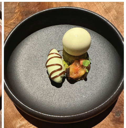
The elegant, micro-seasonal, zero-waste offerings at LOCO Ristorante in Lisbon.