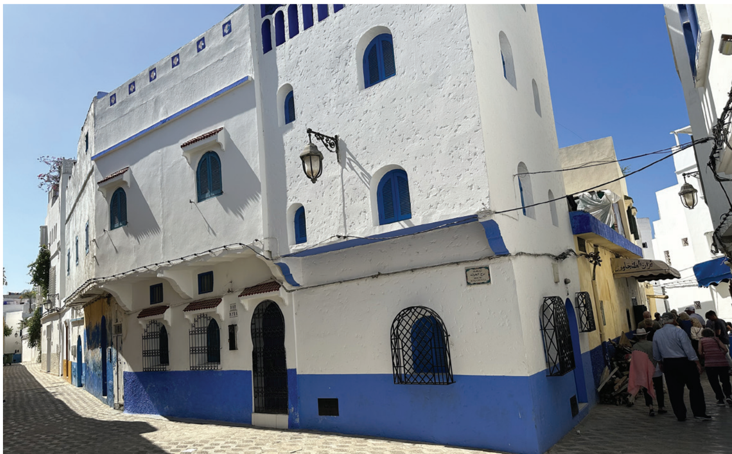
Typical walkways and structures found in Asilah, Morocco.