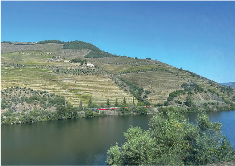
Terraced vineyards along the Douro River.