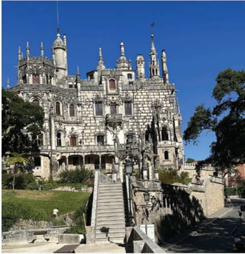
The Quinta da Regaleira castle and its beautiful grounds.