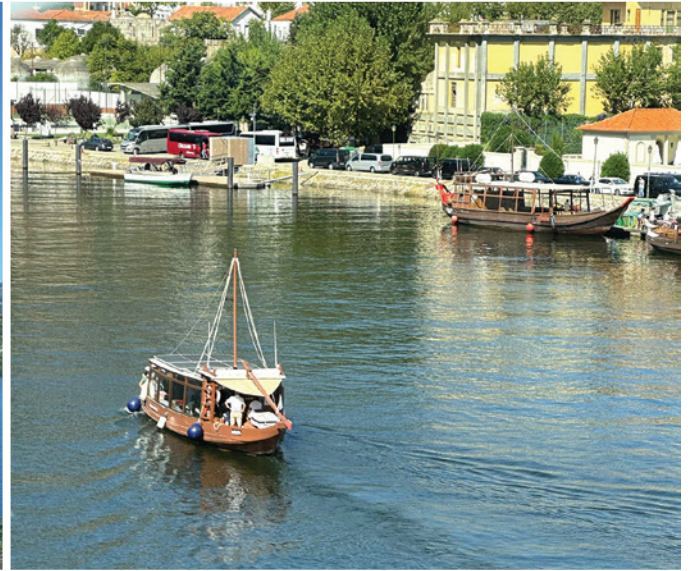
Robalo boats used to transport port wine along the Douro River.