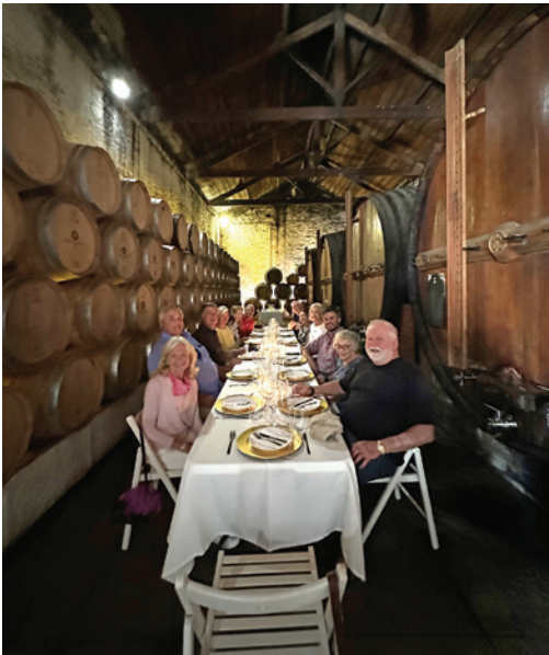
Lunch is served in the cellar at Quinta Da Foz.