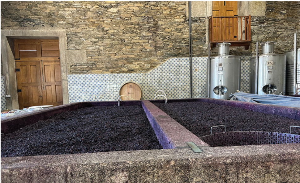
Quinta Da Foz lagar where grapes are foot-trodden to make Port.