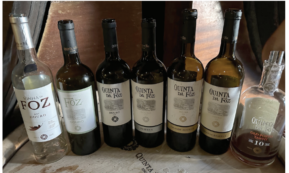
Wines served at Lunch at Quinta Da Foz.