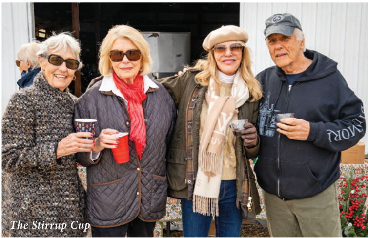
The Stirrup Cup