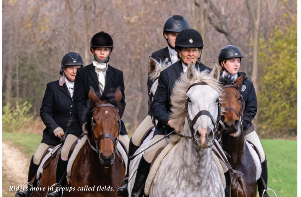
Riders move in groups called fields.