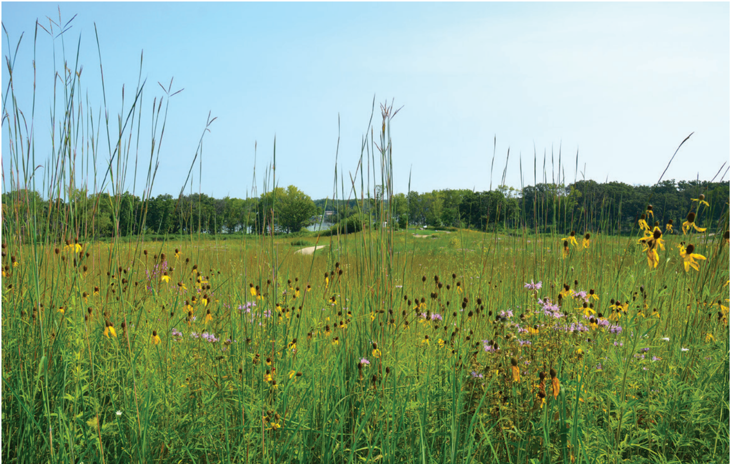
Grassy Lake Forest Preserve is a beautiful spot under Lake County's restoration efforts. At the top of the highest point on its winding gravel trail, you can see the Fox River.