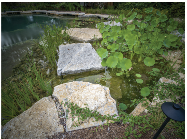
Above: Boulders and stone provide places for bacteria to colonize as they naturally filter out debris. Water is healthier, cleaner and clearer. Below: Adjacent to the sundeck, large slab stones beckon feet to step along a custom walking path through the lotus and waterlily beds.