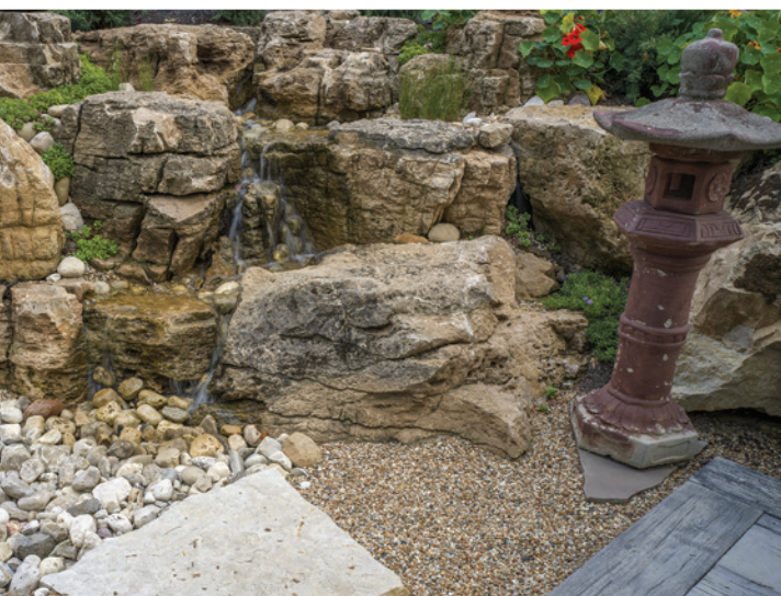
Water flow and ambient sound emanate from two waterfalls that appear as one.

A wide stairway with a handrail provides