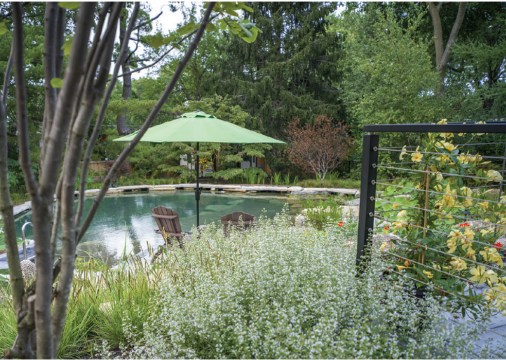
Within this naturalistic setting, perennial and aquatic plantings blend with mature pine trees to create a serene backyard escape for the homeowners. A Zen-style garden features aromatherapy benefits from fragrant plantings, including aromatic thyme and 'Chocolate Chip' ajuga.

partially blocked by the home's air conditioner. Coordinating movement of supplies was a slow, step-by-step process.