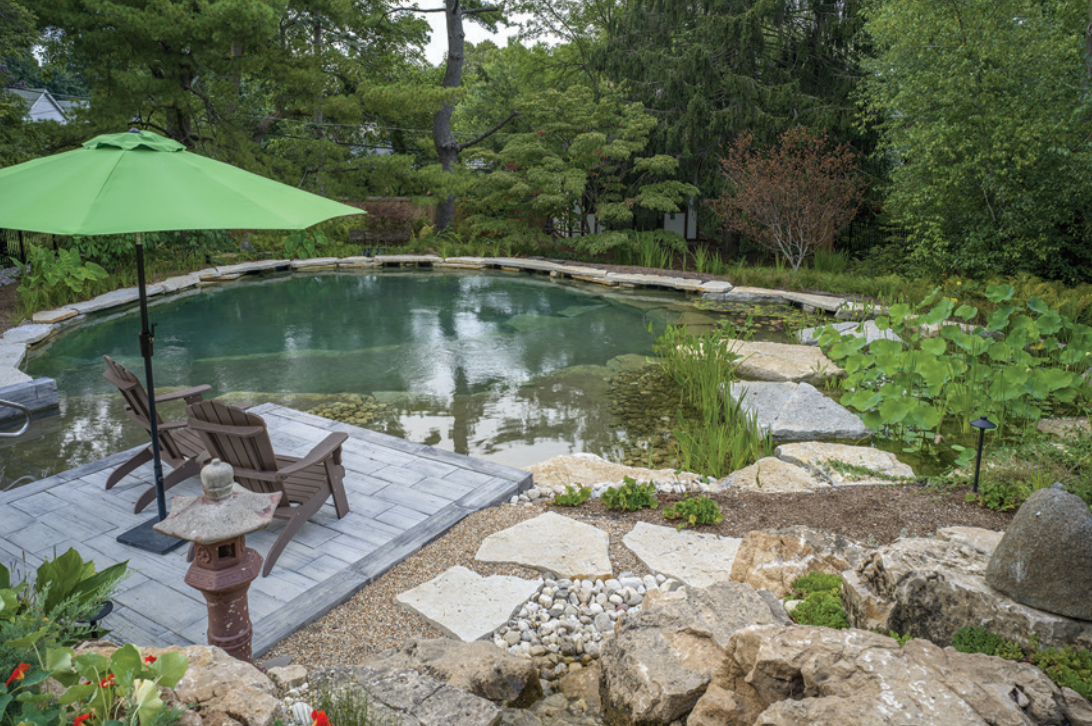
Plants and hardscapes work together to add a sense of enclosure to the natural swimming pool for a feeling of oneness that cleanses the mind, feeds the spirit, and nourishes the soul.

which also has a new, three-foot waterfall. The two waterfalls seamlessly appear as one.