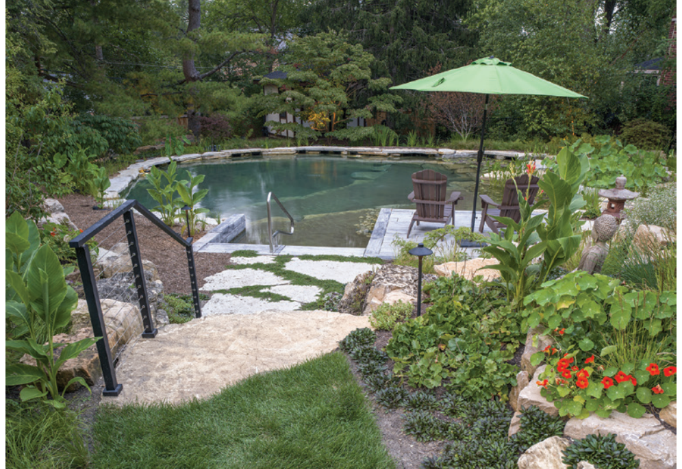
A lush turf carpet leads to a wide stairway with handrail, supporting access to the natural swimming pool.

Off the sundeck, large slab stones beckon feet to step along a custom walking path through the lotus and water lily beds. Japanese honeysuckle, blue flower pickerel, and sweet flag add to the contemplative experience of the journey. Within this unique space, plants and hardscapes work