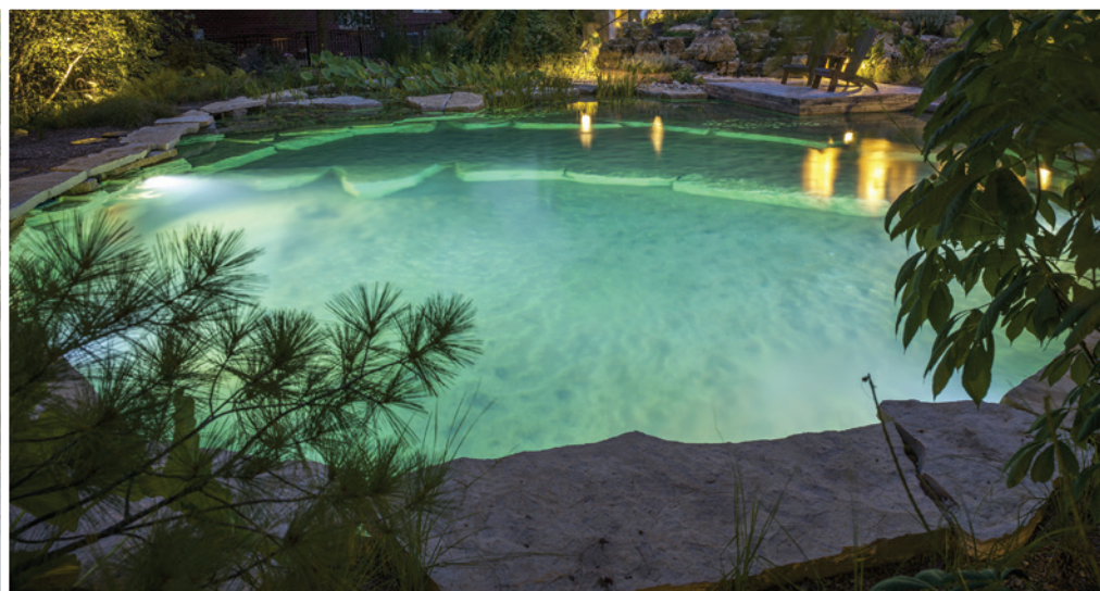
A submerged ledge provides space for reflection and meditation, and a transition point into the pool. Water is crystal clear thanks to mica from the beach-sand bottom and tiny bubbles from micro-aeration.