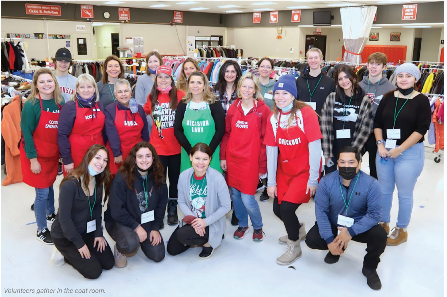
Volunteers gather in the coat room.

Barrington Giving Day event photos