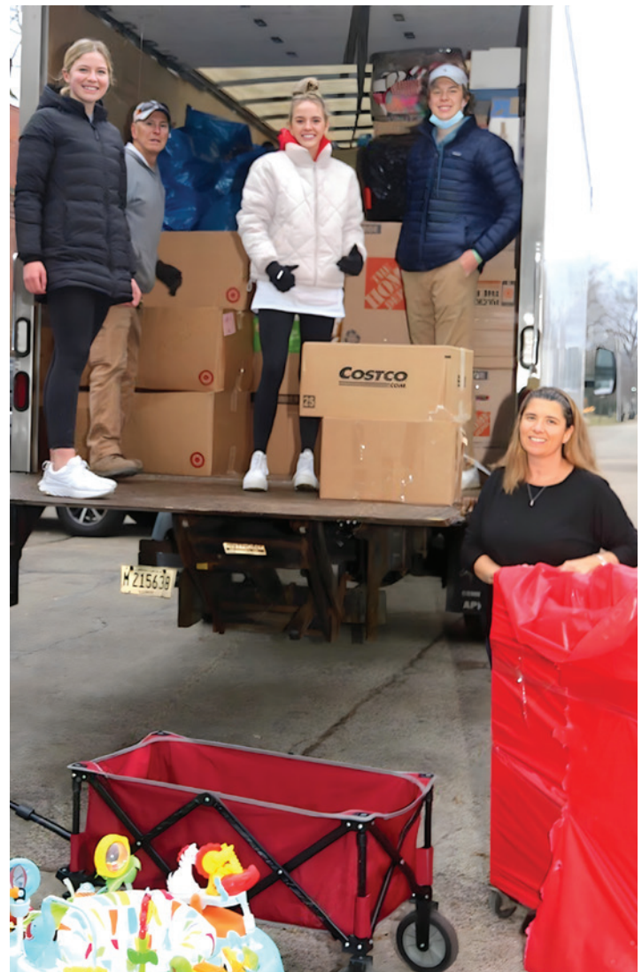
Volunteers organize items that are stored until the winter event. This year, The Arboretum of South Barrington team has generously offered to be a storage site.

Then there are times when I don't have enough shoes or boots in a particular size, and I have to tell a parent how sorry I am that I don't have what they need for their child. They insist that they are okay, that they are grateful for all the other things that they have received. I'm truly humbled by their gratitude. I feel that I can't complain about anything in my own life. The experience of working with our Barrington Giving Day families has grounded me.