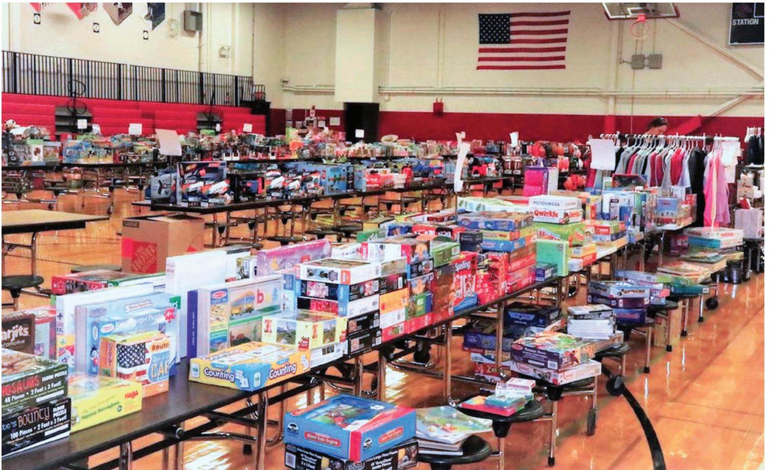
The entire gym is filled with toys and games.